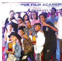
TDDP's Beatboxers and Rappers qualify in Top 30 in Dharavi's Got Talent