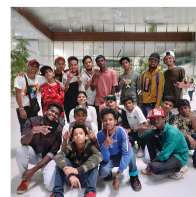
Young TDDP Talents Shine at Godrej Culture Lab's Who's Land Is it Anyway event