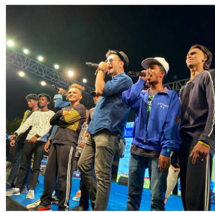
Showcasing Our Hip-Hop Skills at IFACE 2020 in Surat