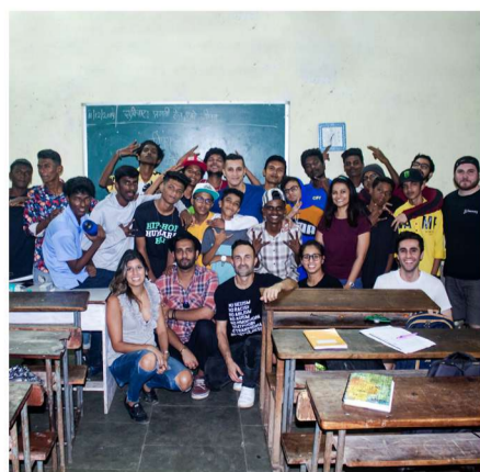
Hip-Hop Legend Ishq Bector Visits TDDP